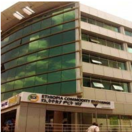
Ethiopian Commodity Exchange

to this end. The Exchange started issuing the certificate after cementing an agreement with CQX. The certificate is believed to fetch premium price for farmers as well as exporters. So far, six members of the Exchange have secured the certificate.