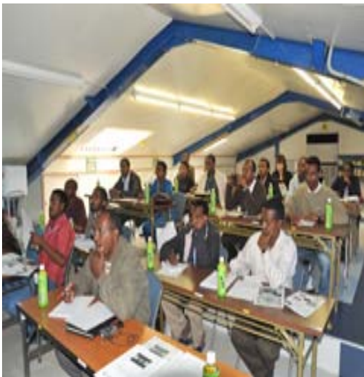
Ethiopian officials and businessmen attending a lecture on Kaizen

It is a process which helped Japan rebuild from the ruins of World War II and create the world's second biggest economy. Now that same concept, known as 'kaizen', is helping developing countries improve their own economies. Ethiopia, one of the world's poorest nations, has embraced the idea and recently a group of ministry officials and business leaders visited Japan to learn first hand how to apply the 'kaizen' principles in practice.