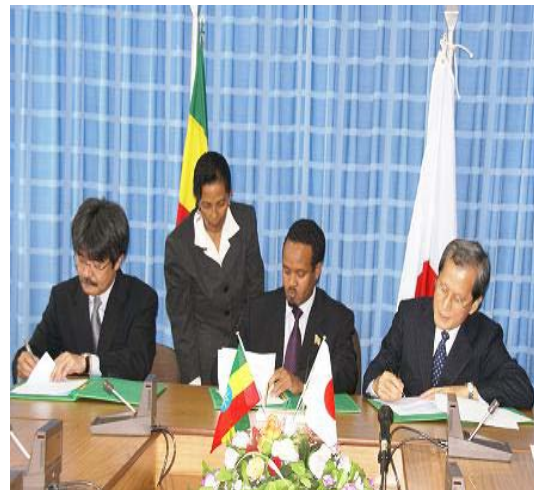
H.E. State Minister Ahmed and H.E. Amb Komano signing the Agreement

On May 14 2010, the Government of the Federal Democratic Republic of Ethiopia and the Japanese Government sign a grant agreement for 13.8 million USD (approximately 184.7 million birr) at the Ministry of Finance and Economic Development