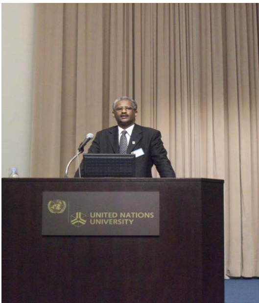
H.E. Amb. Abdirashid delivering the message of the Prime Minister

2010 in Tokyo at the United Nations University under the theme “Environment: Challenges for Africa, the Role of Japan”. The Ambassador of the Federal Democratic Republic of Ethiopia to Japan, H.E. Mr. Abdirashid Dulane read the message of the Prime Minister at the symposium.