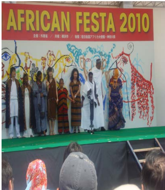
Fashion show displaying the cultural costumes of different Ethiopian Nations and Nationalities

peoples of Ethiopia. In the fashion show arranged by the organizers to promote African culture, a group of Ethiopians and Japanese showcased the cultural costumes of different Ethiopian nations, nationalities and peoples. Ethiopian Restaurants also participated in this annual event selling Ethiopian cuisine to visitors.