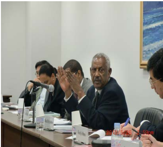
Hon. Ato Sebhat speaking at the Roundtable Discussion at JEF

Hon. Ato Sebhat spoke on the topic of Democratic Institutionalization in Africa in a seminar organized by the United Nations University in Tokyo. In this regard, he underscored that the type of democracy which needs to be introduced and institutionalized in Africa should understand and appreciate the existing problem in the society. It is on the basis of this that the national vision and programs of the country could be formulated and implemented.