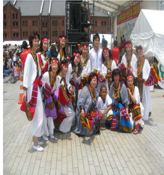
Mocha Ethiopian Dance Group

The event offered a good opportunity to promote the image of Ethiopia by introducing Ethiopian culture to the Japanese people.