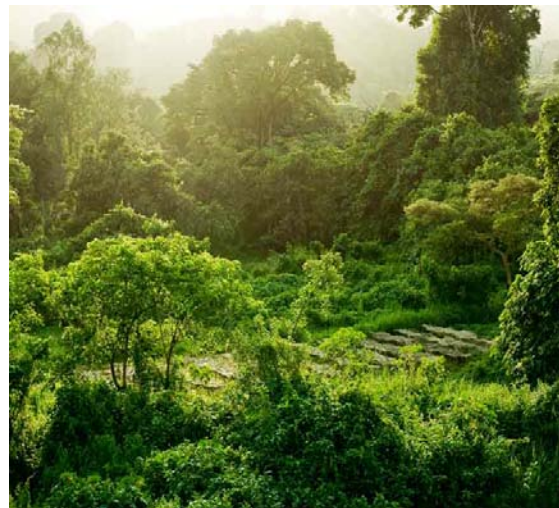
Coffee Nursery in Yayu, Ethiopia

Oromiya Regional State, is part of the Eastern Afromontane Biodiversity Hotspot, one of the world's 34 vital yet threatened areas for biodiversity conservation. The area comprises undisturbed natural forests and semi-forest systems managed for the production of coffee, spices, honey and wood while providing important ecosystem services such as watershed protection in the Nile Basin. The Yayu forest has the greatest abundance of wild Arabica coffee anywhere. Sustainable development activities in the site focus on coffee production, including the planting of fruit trees both for crop and to provide shade for the coffee.