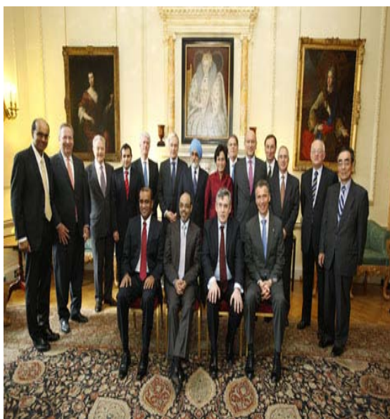
Group Picture of the High-Level Advisory Group

Meles says High-Level Advisory Group on Climate Change Financing identifies financial sources