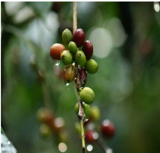
Wild Coffee in Kafa, Ethiopia

more than 50% of Ethiopia's remaining Afromontane evergreen forests ecosystems. It is the place of origin of the rare and critically endangered Coffee Arabica. The site, a scientific, economic, aesthetic and cultural treasure house, is characterized by numerous fertile valleys and lowlands linking the mountains and ridges, and a number of majestic waterfalls, including the Barta and Woshi falls. Public-private partnerships for economic growth and efficient use of resources have been implemented successfully in the area and can serve as models for new initiatives, particularly for sustainable coffee production and marketing.